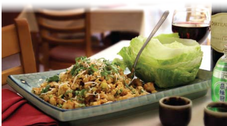
XO's signature lettuce wrap special, a blend of chicken, shrimp, bamboo shoots, water chestnuts, peanuts, and cilantro on a bed of crispy rice noodles.

Explore lunch specials Monday-Saturday, 11 a.m.-3 p.m., and enjoy weekday afternoon happy hour in the full-service bar. XO Asian Cuisine's knowledgeable, welcoming wait staff is pleased to help you make the most of your dining experience. Free two hour parking available for dinner only, as well as takeout and delivery.