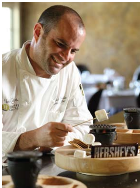
Tableside S'mores with your own personal campfire.