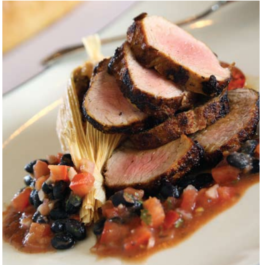
Marinated pork tenderloin with a chorizo tamale and black bean salsa.

Whether it's a business meeting in the dining room, a casual lunch with