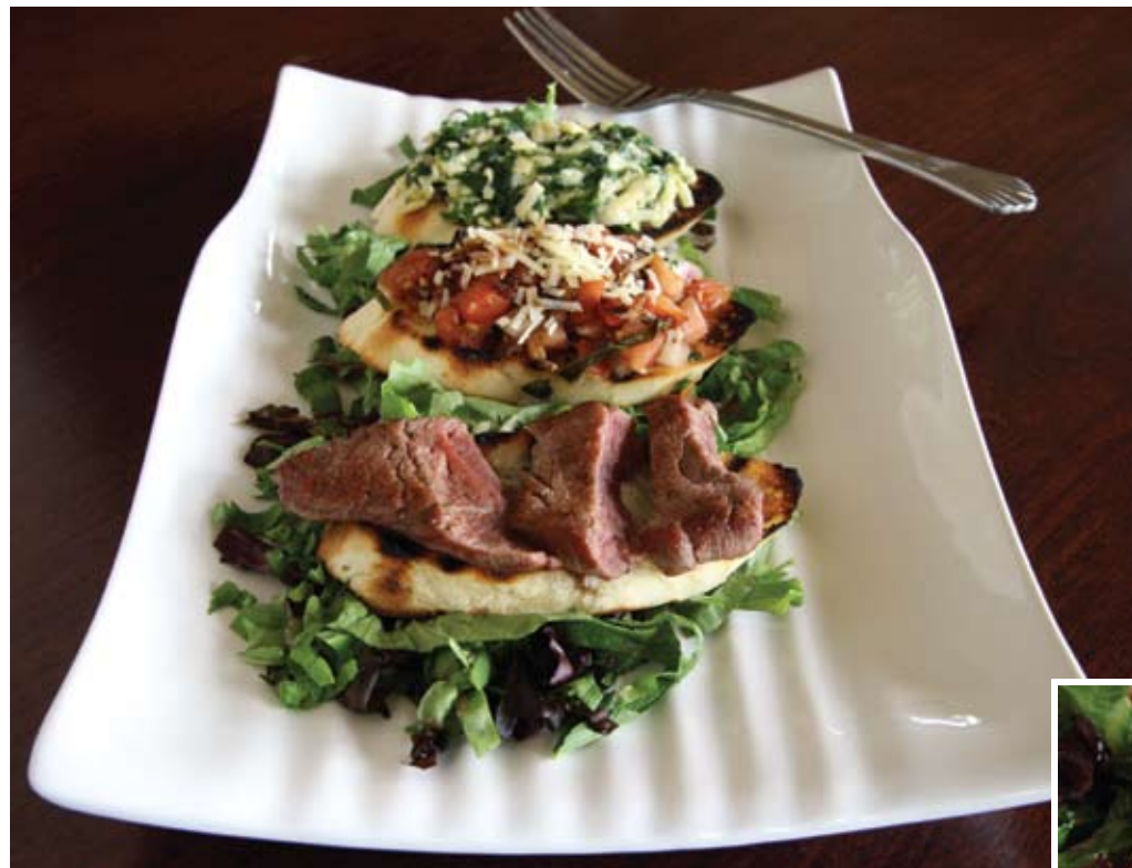
Share the perfect starter: The Acorn Grille's Trio of Bruschetta includes three mouthwatering selections of grilled choice steak drizzled with a creamy gorgonzola sauce, the more traditional bruschetta mixture of diced tomato, fresh basil and chopped garlic heightened by the addition of fine balsamic vinegar, and the third topper of smoked gouda cheese, diced red onions and arugula mixed with extra virgin olive oil.

See directory in the back for locations (616) 447-7750 | www.thousandoaksgolf.com