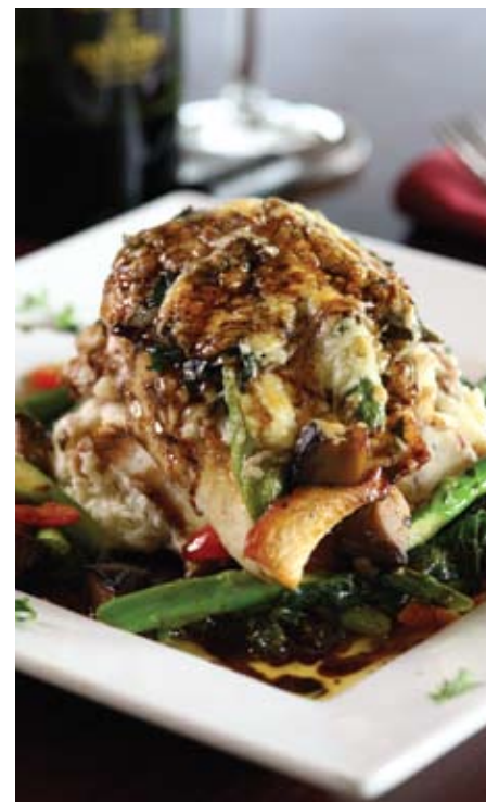
A favorite at the Acorn Grille at Thousand Oaks is their Maryland Crab Cakes. Chockfull of luscious crabmeat, the cakes are served on a bed of sautéed spinach and spiced up with a red pepper aioli sauce.

Whether you just want to relax in the laidback lounge for drinks and hors d'oeuvres or are ready for a full-scale dining experience, you will be well taken care of at Thousand Oaks. Their attention to detail extends from